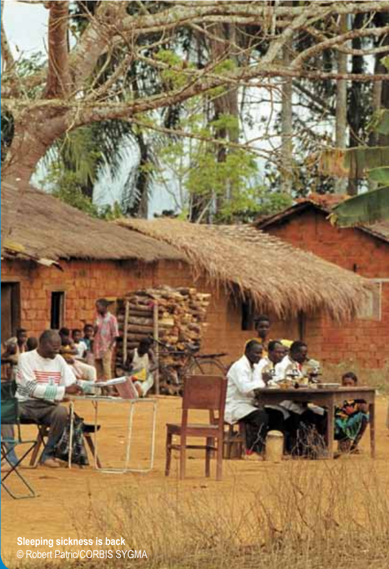
Sleeping sickness is back